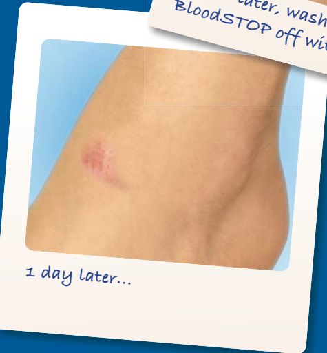
1 day later...

LifeScience PLUS, Inc. P.O. Box 60783, Palo Alto, CA 94306 Toll Free: 1-877-587-5433 - U.S.A. Tel: +1-650-565-8172 - International www.LifeSciencePlus.com