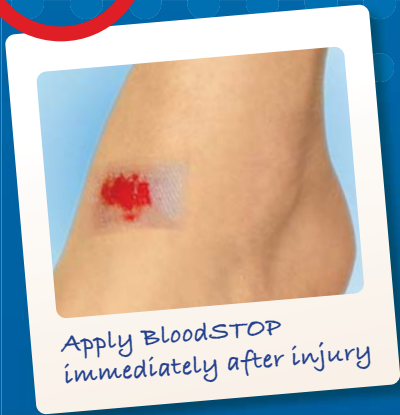
Apply BloodSTOP immediately after injury